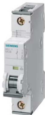
Miniature circuit breaker 230/400 V 6kA, 1-pole, B, 2A, D=70 mm