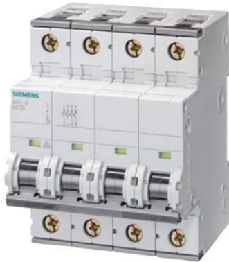
Miniature circuit breaker 400 V 6kA, 4-pole, C, 8A, D=70 mm