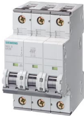
Miniature circuit breaker 400 V 15kA, 3-pole, C, 40A, D=70 mm