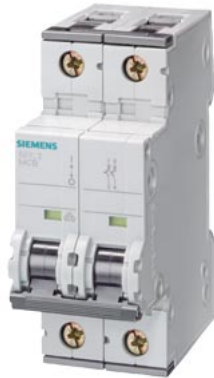
Miniature circuit breaker 400 V D=70 mm 25 kA according to EN 60947-2, 2P, D13