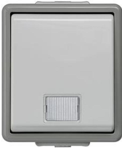
DELTA FLAT IP44, SM DARK GRAY/LIGHT GRAY CONTROL SWITCH OFF, 10A 250V W. WINDOW, PILOT LAMP 66X75MM