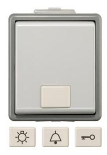
Similar to image