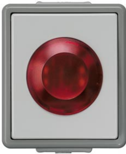
DELTA FLAT IP44, SM LIGHT SIGNAL 250V W. GLOW LAMP, 66X75MM