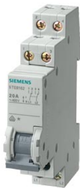
Two-way switch 20 A 2 CO