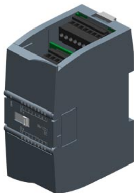
SIMATIC S7-1200, Digital input SM 1221, 16 DI, 24 V DC, Sink/Source