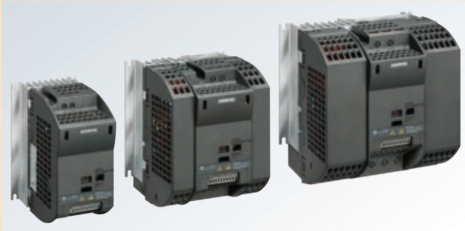
SINAMICS G110, frame sizes A, B, C