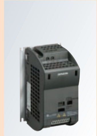
SINAMICS G110, frame size A with flat plate heatsink