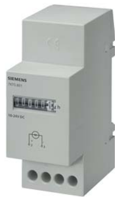
time counter, mechanical, 10-27V DC