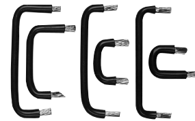
Wye-Delta Wiring Kit