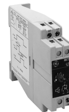
Electronic Timing Relay

1 CK95: use 2 lugs per terminal above 218 Amps.