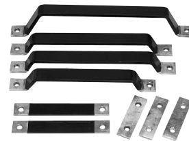
Wye-Delta Bus Bar Kit