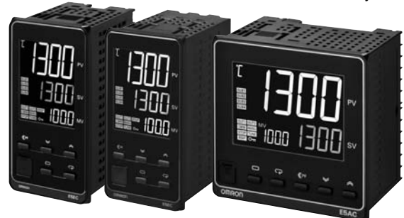
48 × 96 mm Screw Terminal Blocks E5EC