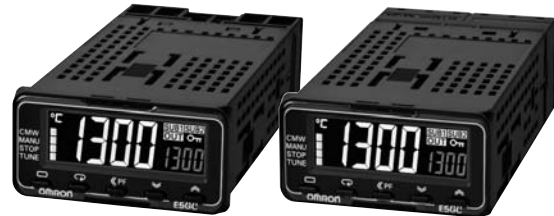
48 × 24 mm Models with Screw Terminal Blocks E5GC-□6