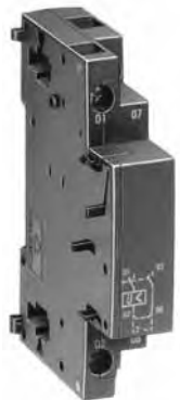
Undervoltage release UA4-HK