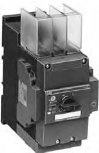
MS495 with auxiliary switch HKS4-02 and open-circuit shunt release AA4 in addition to termi- nal shroud KA495C