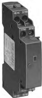
Pilot switch SK4-11