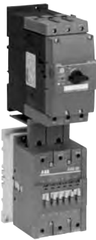
MS495 with A95 connected via BEA 110/495