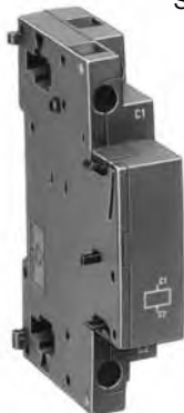
Open-circuit shunt release AA4