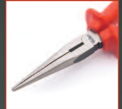
LNP200 Long Nose Pliers