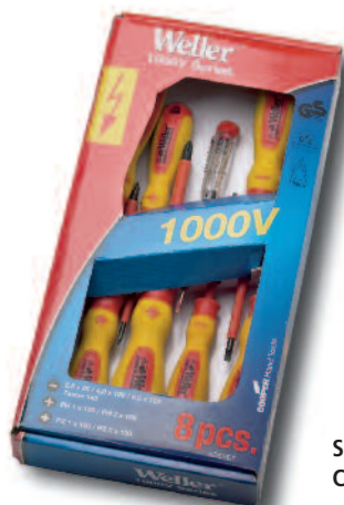
Screwdriver Set 8 pieces Code No. SD8SET