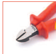
HLDCN160 High Leverage Diagonal Cutting Nipper