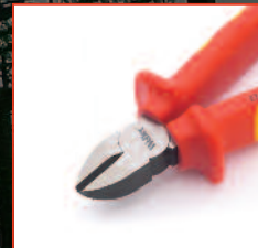
DCN160 Diagonal Cutting Nipper