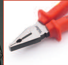
CP180 Combination Pliers