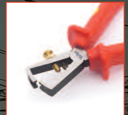
WS160 Wire Stripper