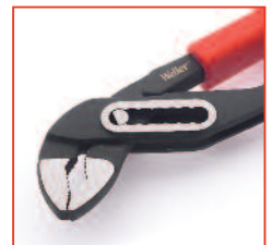
TGP250 Tongue & Groove Pliers