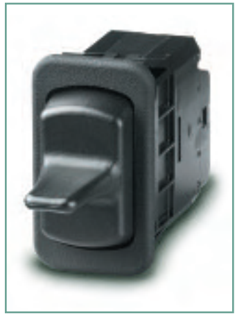
Paddle actuator switch (below panel only)

The SVR part numbering system allows all product features to be captured in a 15-digit part number (switch and actuator). (See How to Order tables on Pages 4 and 5.)