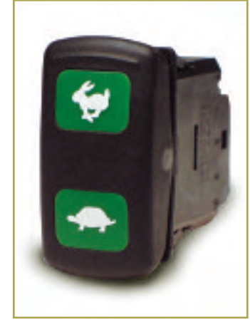
Above panel rocker switch with two green snap-in lenses

Contact your Eaton sales representative for more specific information about standard and custom circuit options.