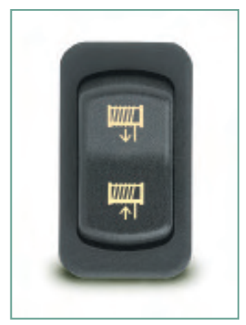
Below panel rocker switch with daylight white icon

Each switch can accommodate up to two LEDs which can be connected to be