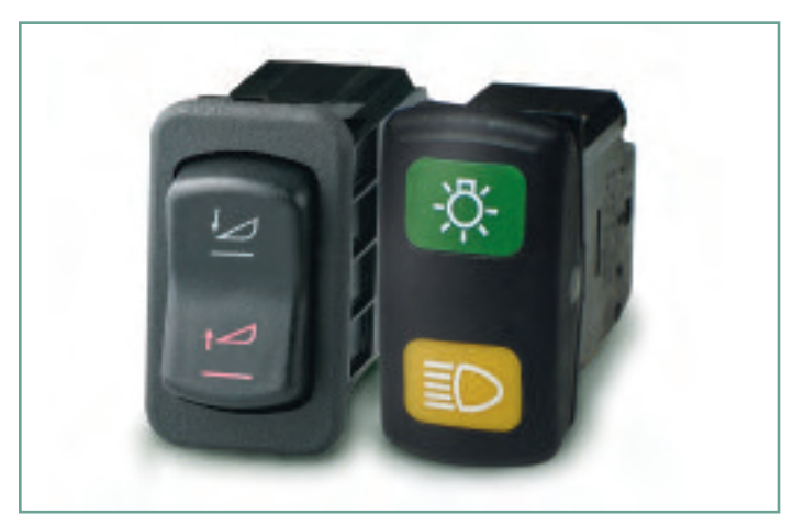
Below panel rocker switch with daylight white icons (left) and above panel rocker switch with two snap-in lenses (right)