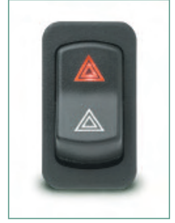
Below panel rocker switch with daylight white icon and red LED